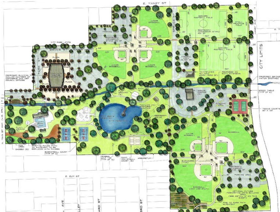
City of Bishop, CA Park Master Plan

Our planners routinely review and analyze development codes and policies and in order to identify goals and make practical policy recommendations for the community. We also provide to our private sector clients a range of development services including property analysis, project design and permit facilitation.